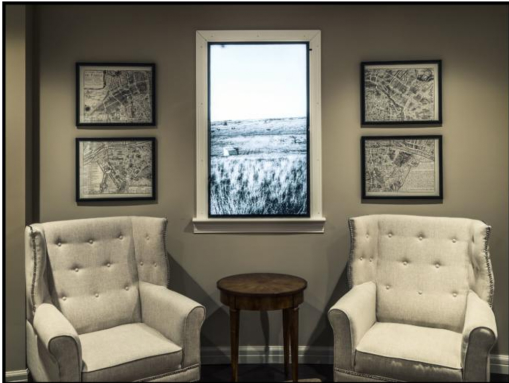
The living room of an apartment at the Survival Condo Project.