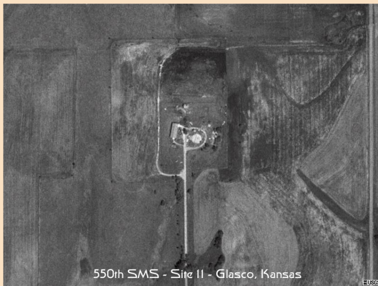
550th SMS - Site II - Glasco, Kansas