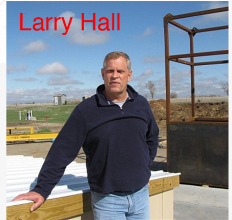
He isn't worried about the end of the world happening this

Strategic Missile Squadron: 550th Support Base: Schilling AFB - Salina, Kansas Operational Site #: 11 Construction Site #: ? Location: Glasco, Kansas Latitude: 39-24-43 Longitude: 097-40-50 Construction Start Date: ??/??/???? On-Alert: ??/??/???? Decommissioned: ??/??/???? Current Owner: Private Individual Web Site: N/A